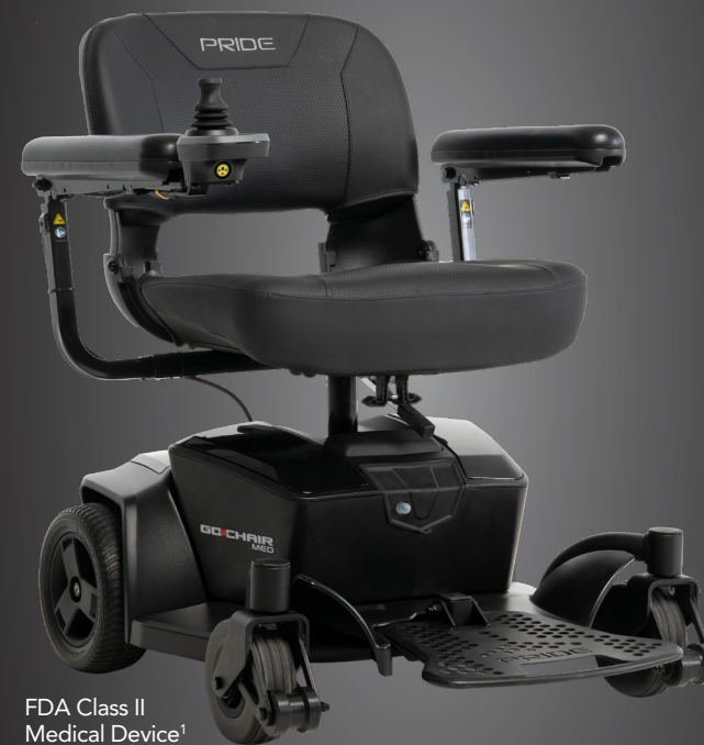
FDA Class II Medical Device¹